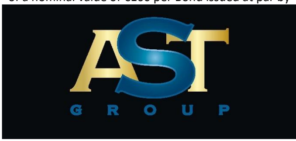
AST Group p.l.c.

of a nominal value of €100 per Bond issued at par by