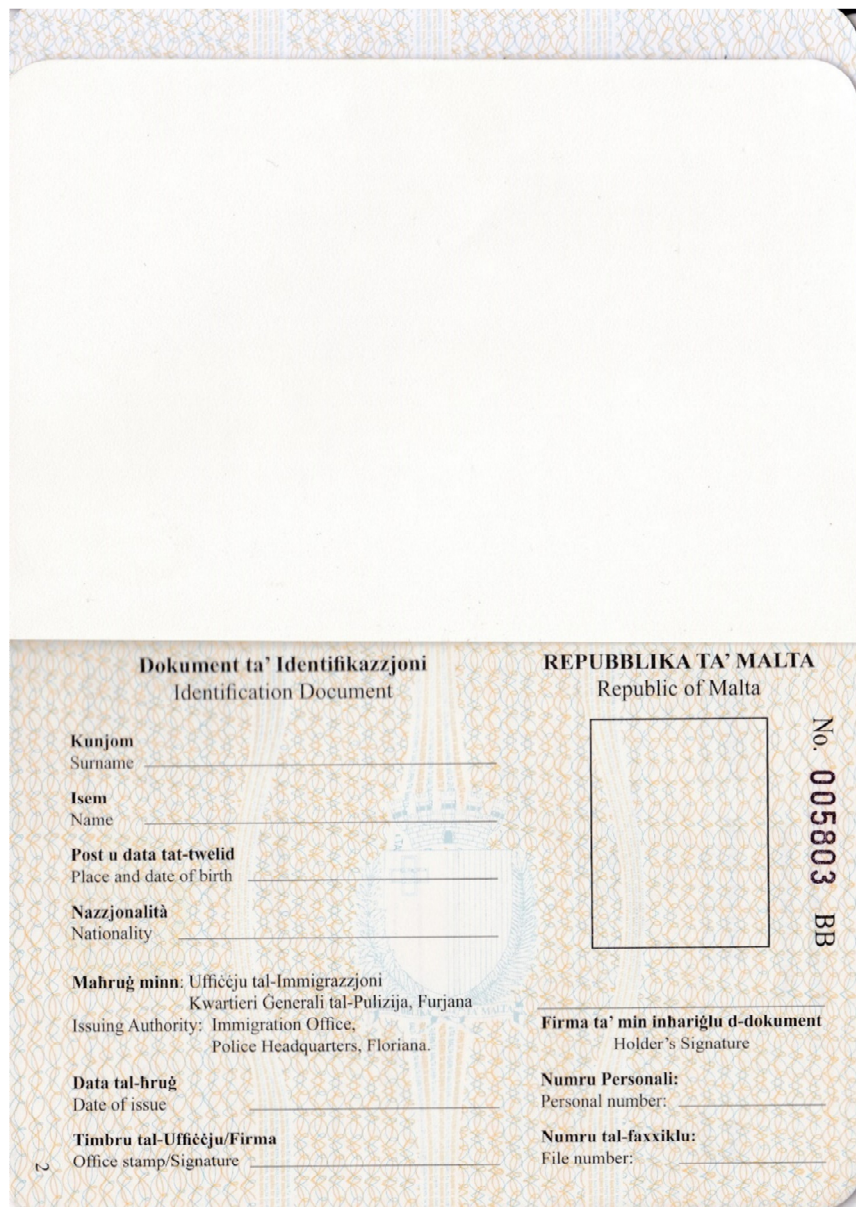
Fig. 11 – Identification Document issued by the Malta Police – Details' Page