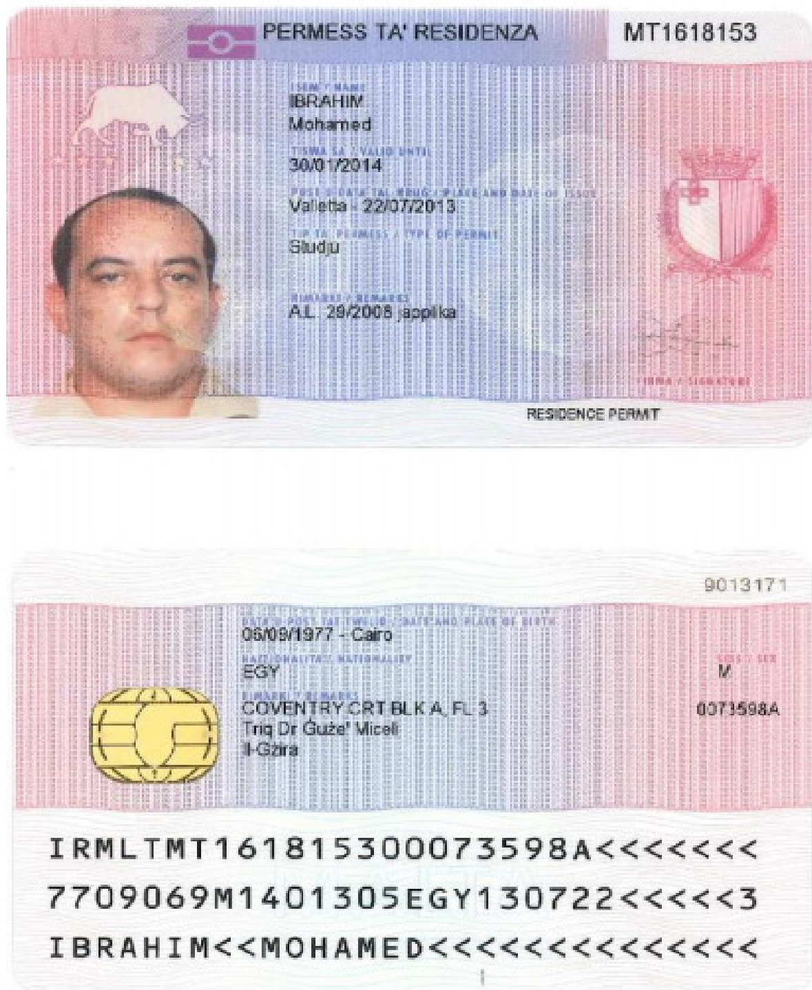
Fig. 5 Residence Permit issued by IDENTITY MALTA to Third Country Nationals