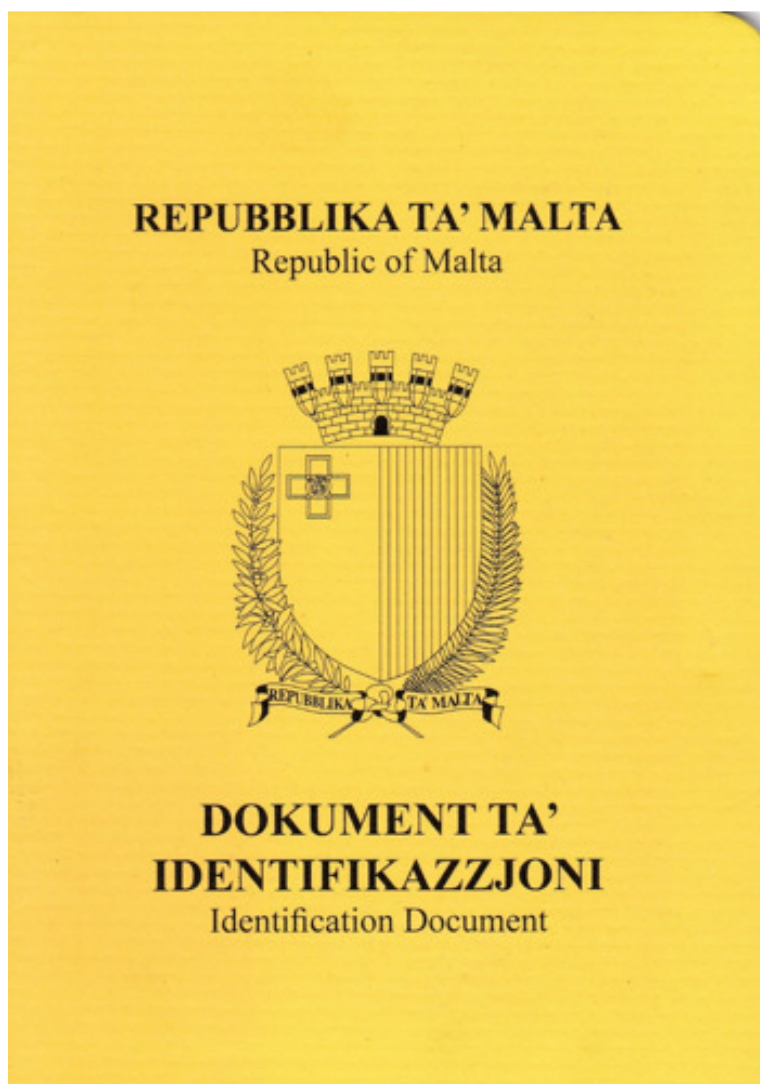
Fig. 10 Identification Document issued by the Malta Police – Front

The Malta Police issues an identification document to all those individuals that cannot be expelled and repatriated. It is important to note that, though this document has a period of validity which can be extended, it no longer remains valid as soon as the immigration authorities can proceed with the individual's repatriation. Moreover, the extension of its validity is not uniform but depends on the holder's particular circumstances.