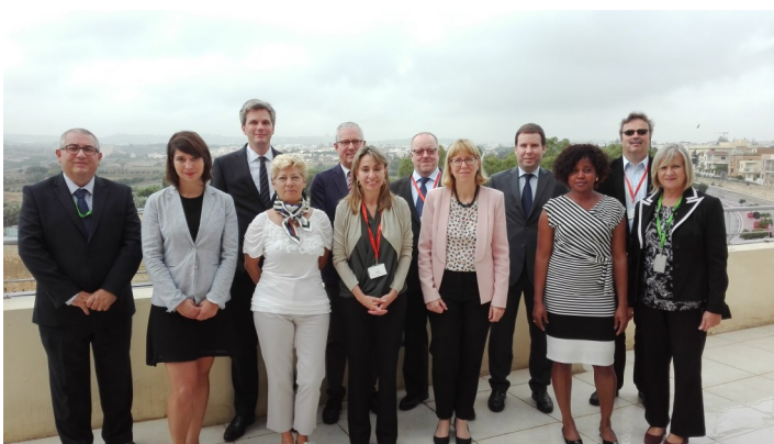
Participants at the ECB Internal Auditors Committee

On the 4th and 5th October 2017, the MFSA hosted the meeting 58th meeting of the Task Force on Quality Management of the ECB Internal Auditors Committee.